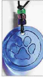
AURORA GLASS FOUNDRY