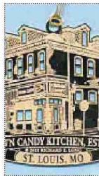
UNITED CEREBRAL PALSY