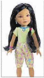
HEARTS FOR HEARTS

THERE'S STILL TIME TO HELP OUR 100 NEEDEST CASES CAMPAIGN, WHICH ASSISTS DISADVANTAGED FAMILIES DURING THE HOLIDAYS. STLTODAY.COM/NEEDEST