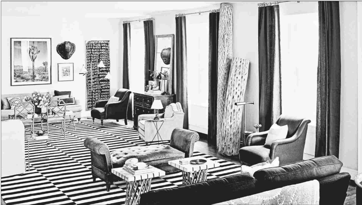
Madeline Weinrib's striped rug mixes beautifully with solid upholstery and ethnic textures in designer Nate Berkus' living room.

Modern rugs, she says, might be handmade of high-quality wool, but not be as expensive as a top-notch Oriental, and, therefore, are less of a commitment and, possibly, more of a personal statement.