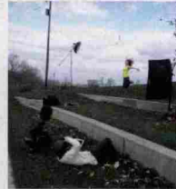
Our winner jumping — one of about 35 times she did that — in front of photographer Nelson Augé and assistant editor Tiffany White.

Our Top Ten Teens are featured on page 27. They were jumping for joy and full of enthusiasm.