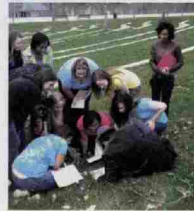
Girls try to take a peek after the "big" photo jumping session.

Get yourself tested for National Stroke Month. Check local hospitals for free screenings before something happens that you cannot change.