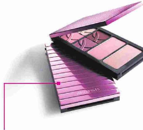
Prescriptives pink ribbon palette for cheeks and eyes ($48.50) at prescriptives.com. Prescriptives will donate $20,000 in connection with North American sales to The Breast Cancer Research Foundation.