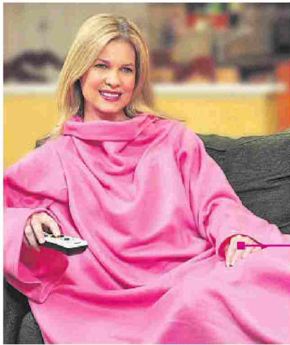
Pink Snuggie fleece throw ($14.99) at Bed, Bath & Beyond. A portion of the proceeds from the sale of this product benefits the Breast Cancer Research Foundation.