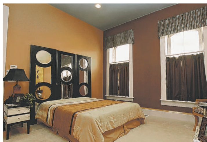
A tall, mirrored headboard and graphic appointments are part of the contemporary design of one of the Kisers' three bedrooms.

Dark maple cabinets, cream-and-brown granite countertops, mosaic backsplash and stainless steel appliances give the kitchen sleek appeal.