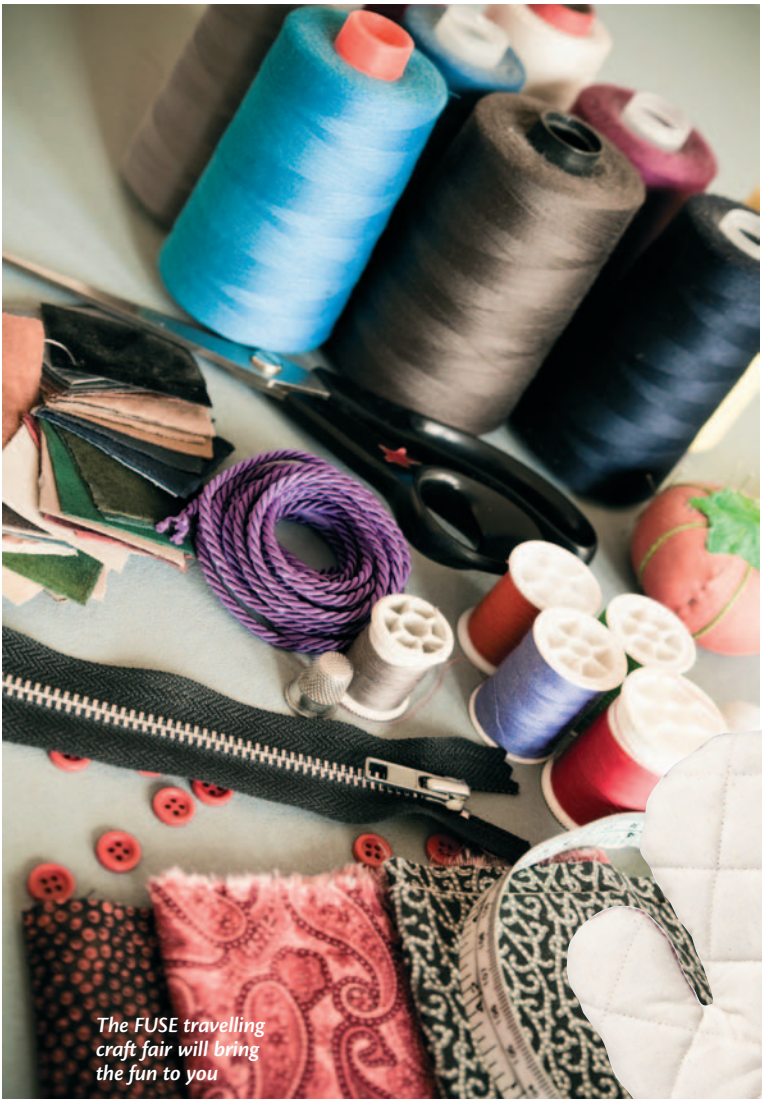
The FUSE travelling craft fair will bring the fun to you