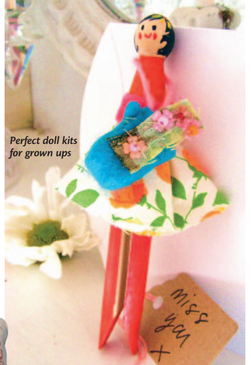
Perfect doll kits for grown ups

These adorable crafting kits would make the perfect gift for a creative friend! Available now from www.growupcraft.com , each kit contains one peg dolly, a pillow envelope, four squares of vintage fabric, retro buttons, recycled felt, ribbons, flower petals and more. The sets were thought up by crafting duo Kate and Katie after they found themselves revisiting their childhood hobbies of fabric, dollies and yarncraft – and we love them!