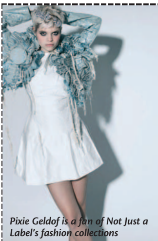
Pixie Geldof is a fan of Not Just a Label's fashion collections