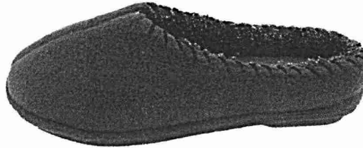
Editor: Judy Antell

Moms can relax their tired feet – and help the environment. Smartdogs' Pure Slipper is lined with fleece made from recycled plastic bottles, and the cushioned sole is from recycled plastic rubber. The indoor/outdoor shoe can be worn to take out the recyclables, and they are washable, so you'll get more wear out of them. $48 each in five colors, including the green Kelp, at www.smartdogsccomfort.com or www.zappos.com .