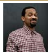
MIKE EPPS, coming soon, to StarDome Comedy Club

HAPPY MOTHER'S DAY...to all mothers, and all nurturers!!!