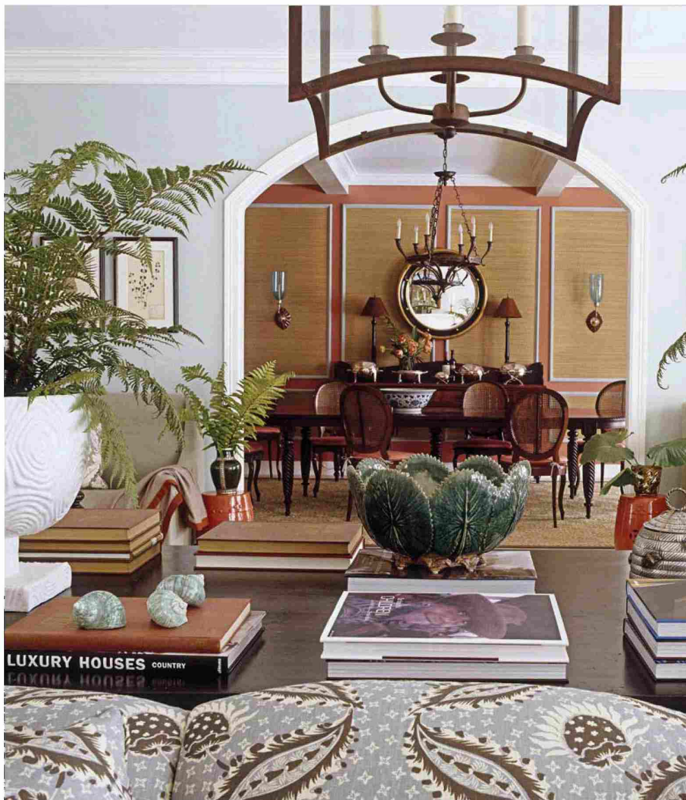
NATIONAL SPLASH: An appreciation of Robert and Janice Aron's 7,237-square-foot Wellington home is spread across 10 pages in the August issue of House Beautiful . The dining room, seen through an arch in the living room, has an idea you can steal: grass yoga mats framed in panel moldings.