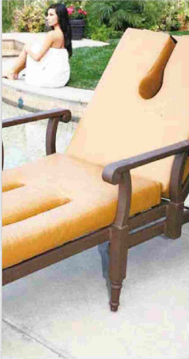
ABOUT FACE: Spa Cushion is designed to allow you to get comfortable while on your stomach. Spa Cushion photo