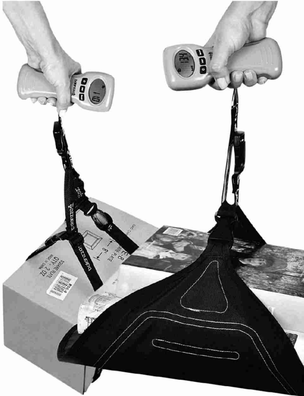
LIGHT WEIGHTS: Balanzza's handheld digital luggage scales, above, and Zelco's lighted pen.