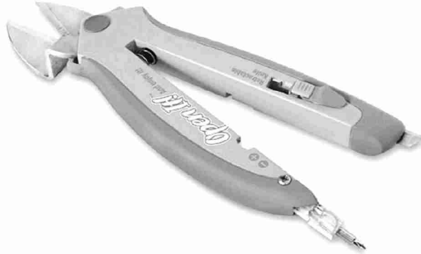
SMALL WONDERS: The Zebra Open It multi-tool, above; Dymo's little Label Buddy, below left, and Rio Brands' Sand Anchor.