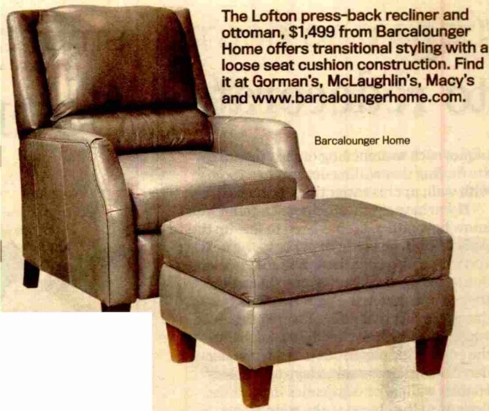
The Lofton press-back recliner and ottoman, $1,499 from Barcalounger Home offers transitional styling with a loose seat cushion construction. Find it at Gorman's, McLaughlin's, Macy's and www.barcaloungerhome.com .