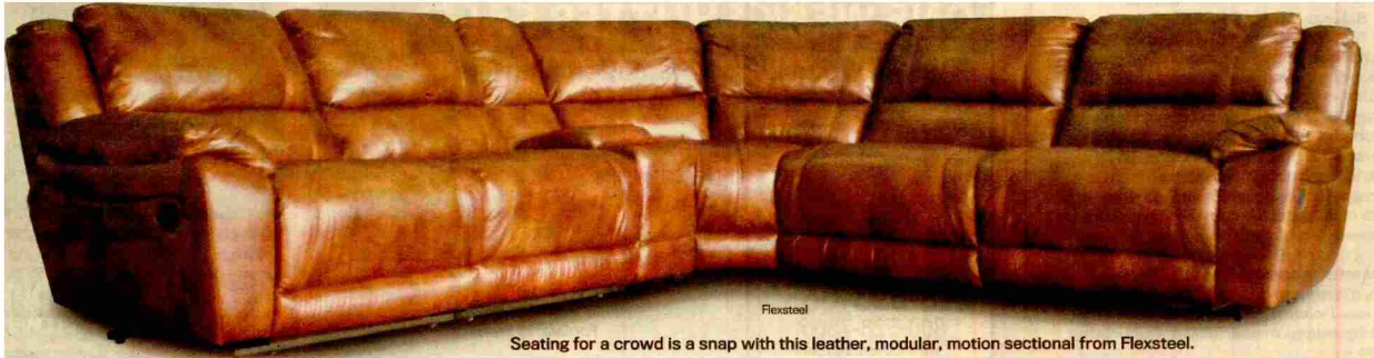
Flexsteel Seating for a crowd is a snap with this leather, modular, motion sectional from Flexsteel.