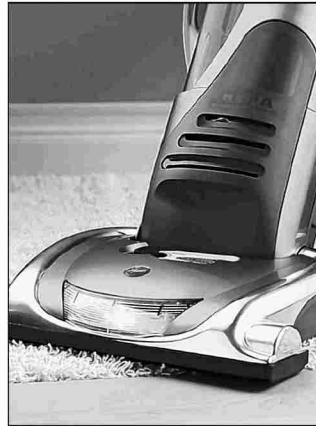
Hoover's Anniversary Edition Convertible vacuum.

There's a bagged model, a bagless model, a self-propelled and a bagged canister — but looks-wise, the winner is the Convertible, which is bagged or bagless depending on what buttons the user pushes; it comes in bronze metallic at a suggested price of about $250.