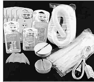
A cornucopia of devices for keeping little ones away from household dangers.

The kit retails for $57.84 and can be ordered at (866) 222-0030 or cableorganizer.com/child-safety-kit .