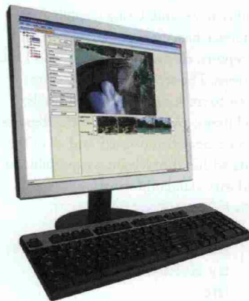
2 Wireless Remote Surveillance System by Kenwood

The Wireless Remote Surveillance System consists of a monitor station and a base station linked via NEXEDGE® digital transceivers. A video camera mounted on-site sends still images