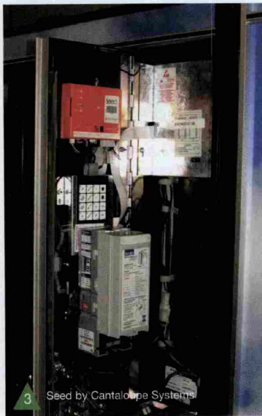
3 Seed by Cantaloupe Systems

Once placed into a vending machine, Seed harvests data from the DEX serial port and sends information wirelessly to a cellular hub using its antenna. The hub receives data from multiple machines and relays all of the information to the Cantaloupe Systems home base. The data is then encrypted and stored in robust SQL databases so vendors can