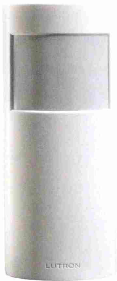
5 Radio Powr Savr™ by Lutron Electronics Co., Inc.

Powr Savrs have two replaceable CR 123 lithium batteries and can reduce lighting electricity usage by 25% to 40% in a given space, depending on overall system configuration. The sensors are compatible with Lutron's Maestro Wireless® non-neutral switches, GRAFIK Eye® QS Wireless control units, and the Energi Savr Node™ product family. Enter #593 at TodaysFacilityManager.com