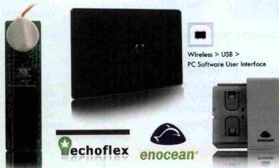
4 EEK200C Evaluation Kit by Echoflex Solutions, Inc.

The EEK200C Evaluation Kit consists of two transmitters, the STM-110C solar powered sensor module with integrated reed switch, temperature sensor, and set point adjustment and the PTM-220C mechanically powered switch module used for on/off and